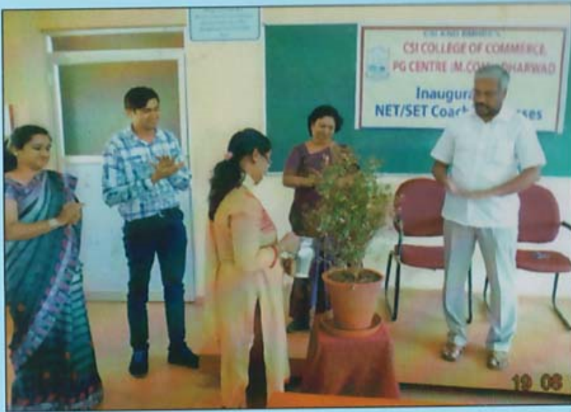
Inauguration of NET / KSET Coaching Classes