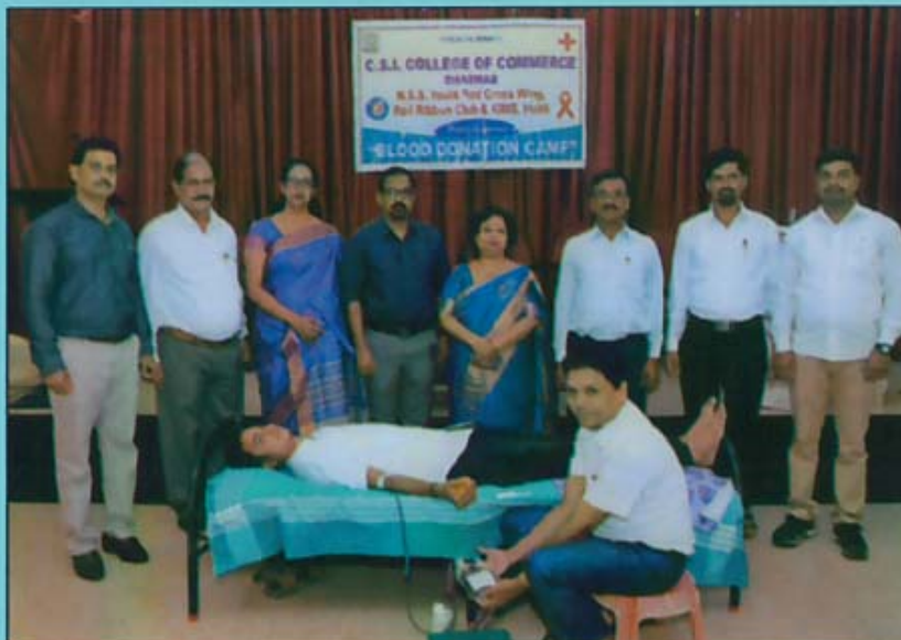
Blood Donation Camp jointly organised by YRCW, NSS, RRC, in collaboration with KIMS, Hubli