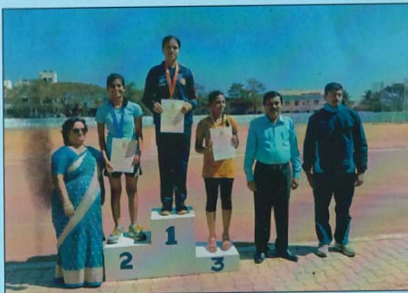
Winners of Annual Sports Meet on the Victory Stand