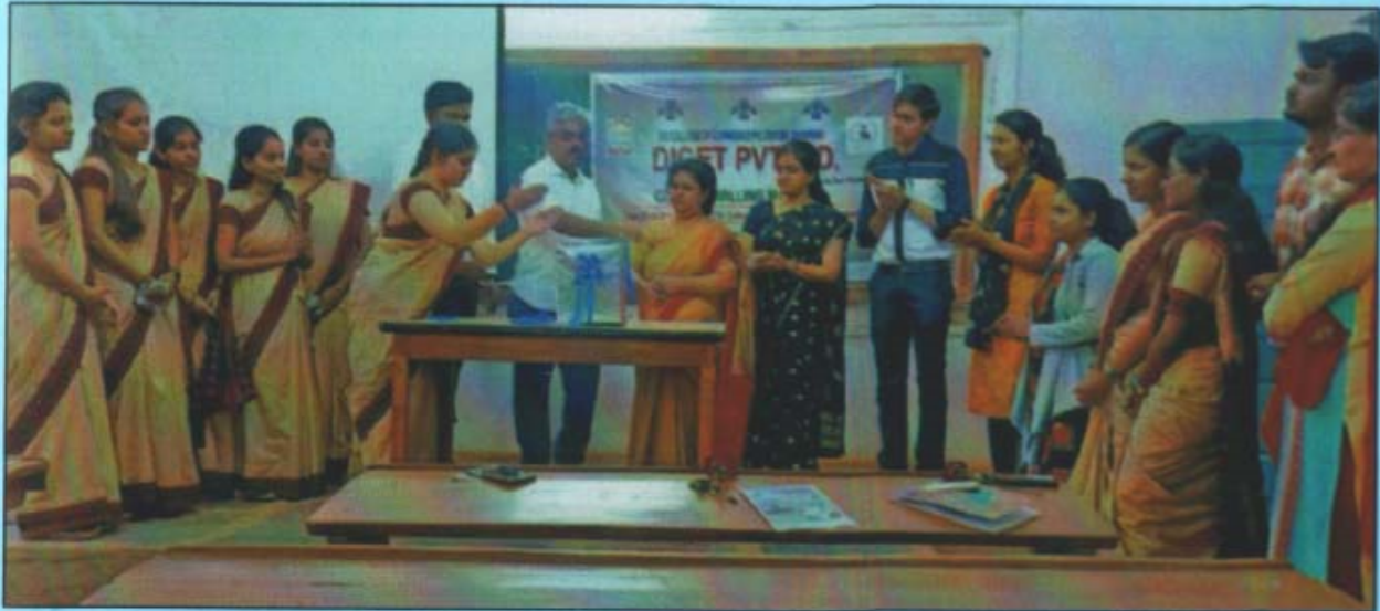
Product Launch Event for M.Com.I Sem students