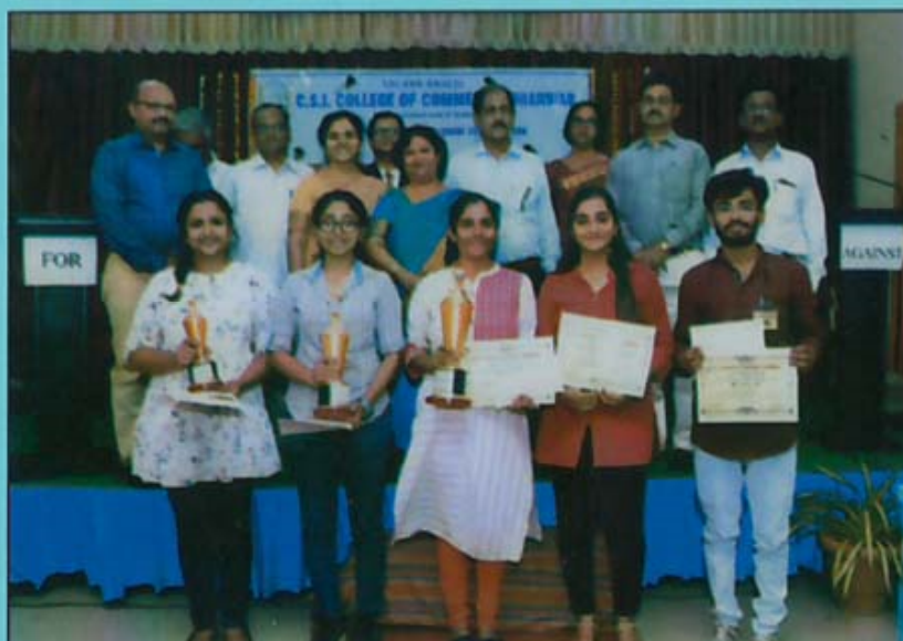
Winners of State Level Inter-Collegiate Debate Competition with Principal, Judges & Faculty Members