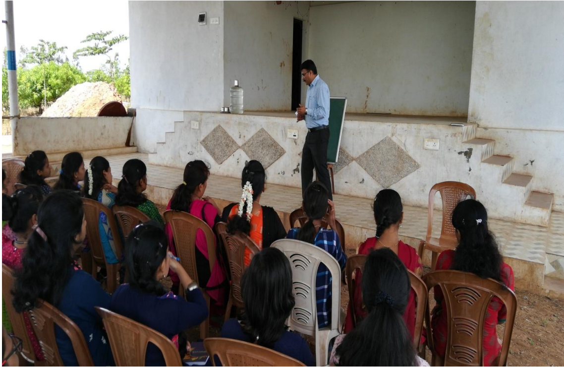
"UDAAN- Take off"- one-day Induction Programme. Date : 18-09-2016